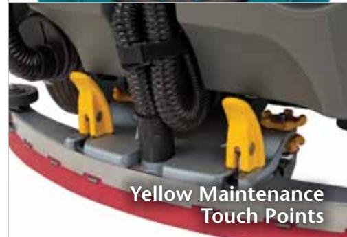
Yellow Maintenance Touch Points